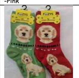
FCC-59 Labradoodle -Green -Red