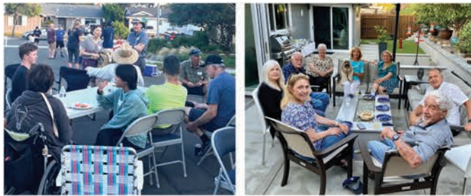
Neighbors gather in cul de sacs and backyards

All involved gathered their neighbors for a very fun and food filled evening with Officer Brown stopping by to chat at some locations. The constant hum of conversation and laughter, permeated the evening as neighbors reconnected; this is just one of the events that makes our neighborhood special.