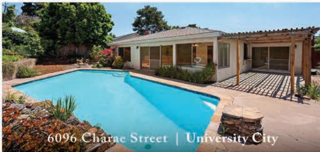
6096 Charae Street | University City