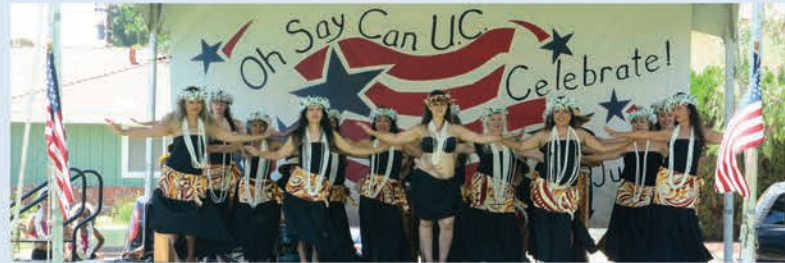
And the best thing...making memories for the kids.