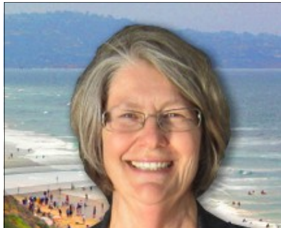
Councilmember Sherri Lightner — District 1

Twitter: www.twitter.com/#!/SherriLightner