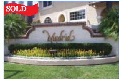
4025 Porte De Palmas #79 • $660,000