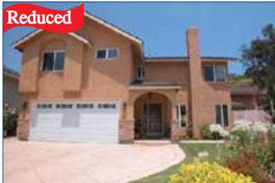
3293 Lahitte Court • $875,000