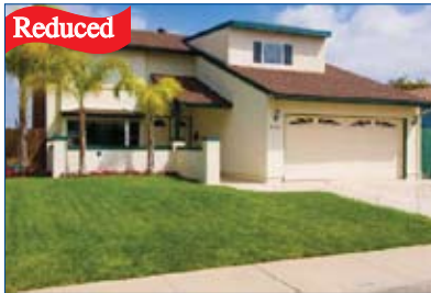
4460 Huggins Street • $760,000