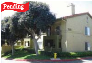
7405 Charmant Drive #2211 • $209,900