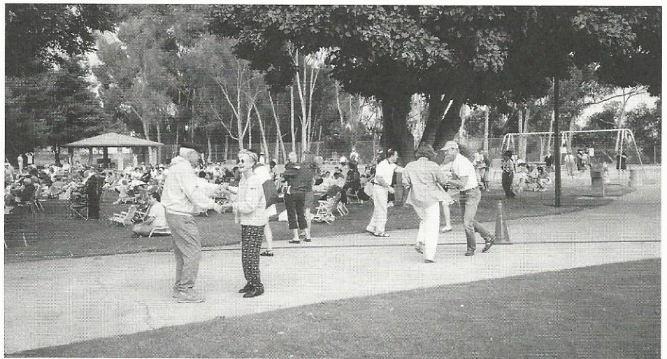
The rock & roll beat brought UC residents to their feet at a recent Sunday Concert at Standley Park.