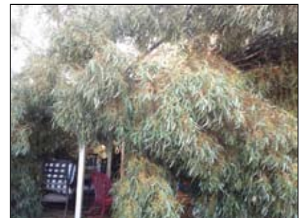
In the world of weather news: A giant Eucalyptus tree fell March 20, damaging a home on Via Papel.