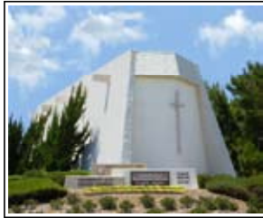
University City United Church —A Progressive and Inclusive Congregation—

April 9 & 23 Saturdays 5:11-6:00 p.m. Contemporary Gathering with live music!