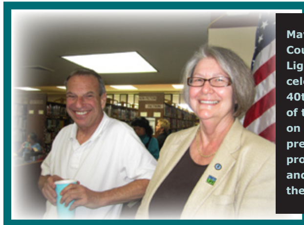
Mayor Filner and Councilwoman Lightner helped celebrate the 40th anniversary of the UC Library on Governor by presenting City proclamations and sharing in the festivities.