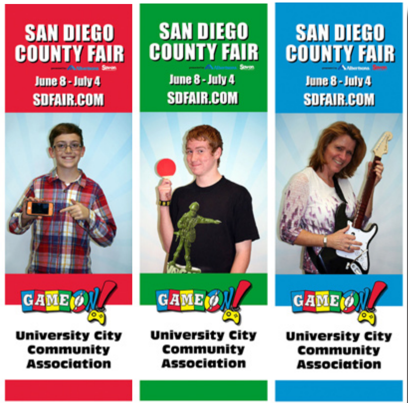
University City's new street banners, featuring our children and librarian with the San Diego County Fair's "Game-On" theme.