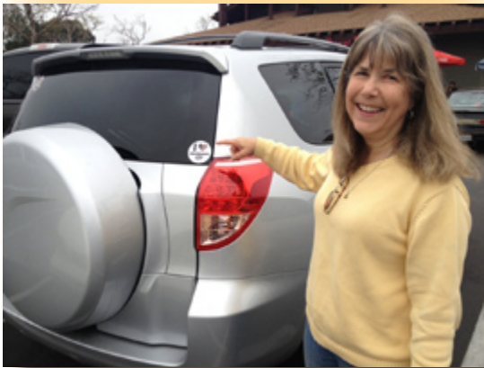
Another happy UCCA member pointing out her "I love University City" sticker on her car.