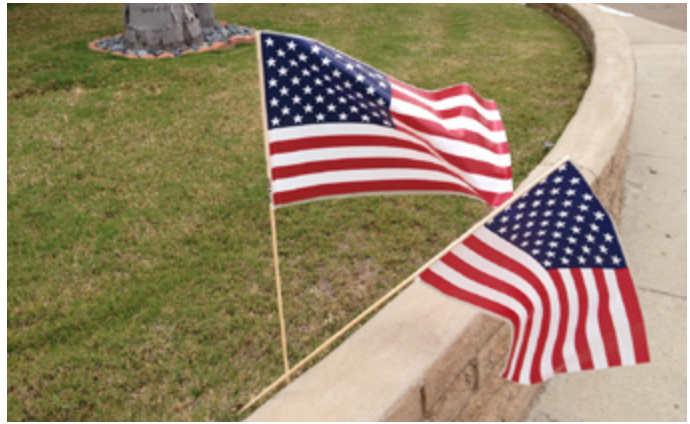
Flags placed around UC on Memorial Day.