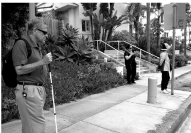
Bus stop and no bench.

UCCA didn't like that answer and pursued the issue. Now there will be a new bus bench installed on the dirt patch adjacent to the concrete patch. While bus benches are not works of art, other than displays for ads, they do serve the community of bus riders who have to wait. Watch for the new bus bench, and give thanks to MTS and Councilwoman Lightner's office. If you have complaints, contact UCCA, your community association, that loves to solve problems. If you haven't joined UCCA yet, can we complain back?