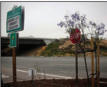
Jacaranda tree, at the Park and Ride, in full bloom this summer.

Normal wear and tear or age damage is the responsibility of the homeowner, who can take advantage of the City's 50/50 Cost Sharing Program to have repairs done. With an ever-increasing