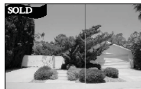
4586 Robbins Street $645,000