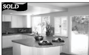
6223 Lakewood Street $790,000