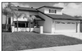
4460 Huggins Street $768,550