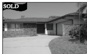
3374 Tulane Court $590,000