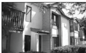
4064 Nobel Drive #103 $399,950