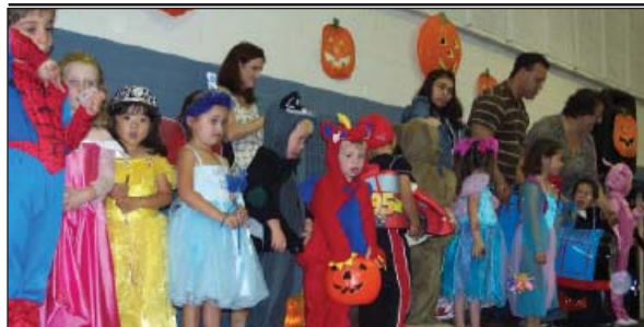
Halloween Carnival at Standley Park on Friday, October 24th