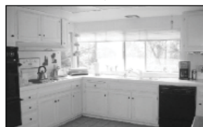
3683 Syracuse Avenue $672,500