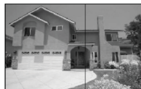
3293 Lahitte Court $895,000-$925,000*