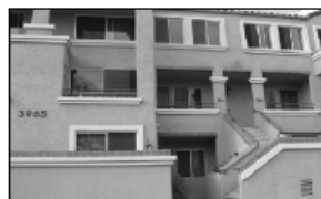
3965 Nobel Drive #246 $350,000