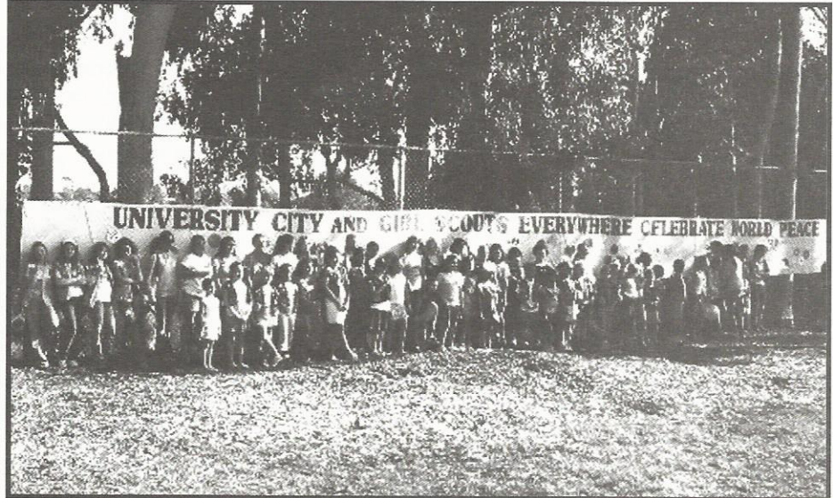
Girl Scouts and children at the UC Peace Day carnival stand before the 60 foot long banner they decorated with peace symbols. The decorated banner was displayed on the UC Racquetball Club court fence on the International Day of Peace - Sept. 21.

EdUCate! Taste of the Triangle November 14 th