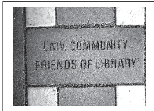
Brick at the new Central Library.

Please call the library to confirm any given program. Cancellations are rare, but may occur.