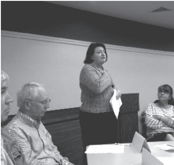
Assemblywoman Toni Atkins speaking at the recent UCCA meeting.

Residential drug rehab houses, a concern of some University City neighbors, is a complex legal problem, according to Atkins. Both federal and state laws involve Constitutional rights. ProtectUC.com is developing documentation of problems surrounding rehab facilities in the west end of UC. Zoning laws could prohibit the clustering of these facilities, but local zoning is trumped by federal and state regulations currently. Atkins promised to give regular 3-to-5 month updates on the progress of dealing with this issue as she worked with local advocates who are okay with two drug rehab homes, but they oppose clustering. To contact your assemblywoman, email usmdc.org/members/a78 .