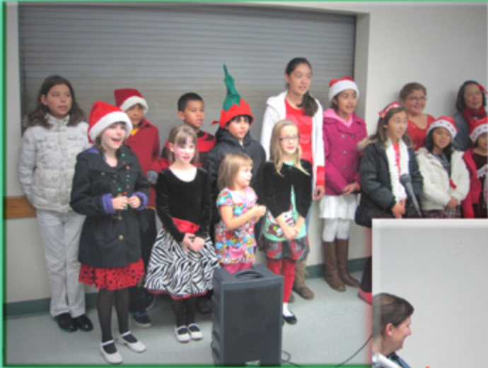
Our Mother of Confidence Children's Choir and Santa