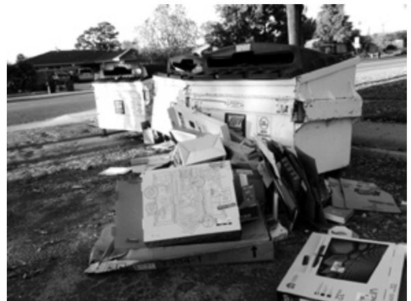
Dumpsters in the Swanson lot, January 12th.