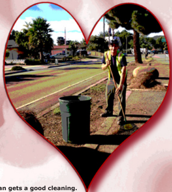
Governor median gets a good cleaning.