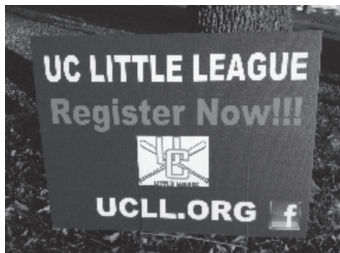
Opening Day for Little League - March 1st