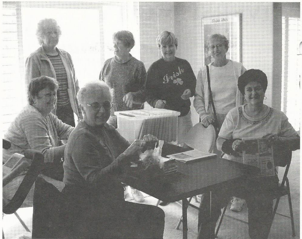
Behind The Scenes... Volunteers sort the newsletters into bundles for delivery.